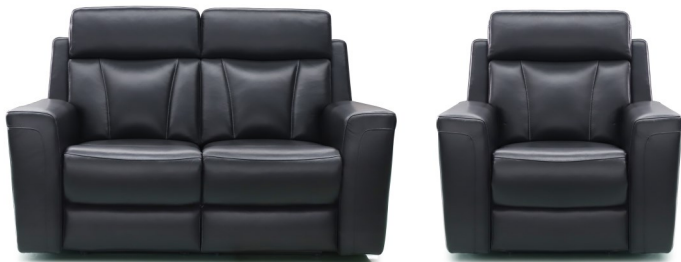
Model: Tango 842478